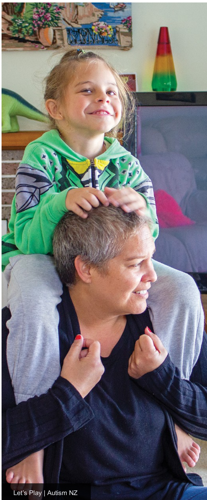
Let's Play | Autism NZ